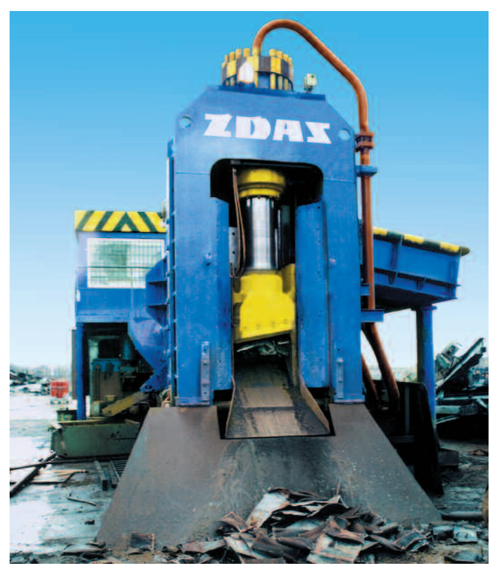
CNS 630-S wing shear is a stationary shear with high output