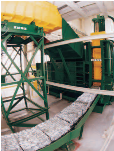
ZDAS CPS 320 baling press in a pressing shop of a large automotive manufacturer