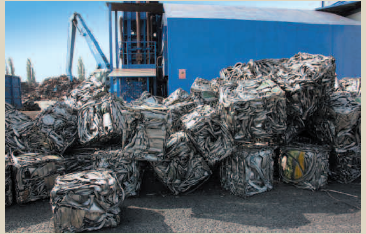
Output of bales