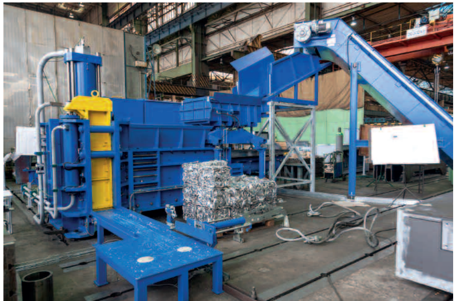
ZDAS CPS 180 baling press in the hall