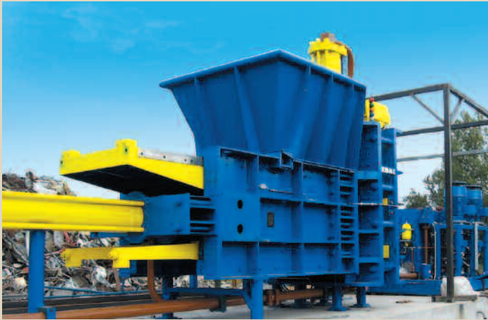
CPS 320 press with a hopper