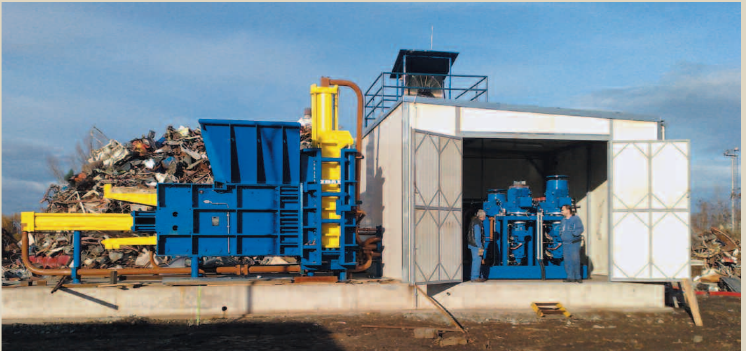
Press drive in a separate cabin

CPS 320 baling presses can be implemented into scrap processing lines of pressing shops in automotive factories. The unit includes conveyers that bring cuttings from individual pressing workplaces and enable transport of compressed bales to the warehouse or directly to the dispatching area. A working cycle of 30 seconds/bale is achieved with an average bale weight of 200 kg, provided that loading is continuous.